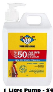
1 Litre Pump - $45