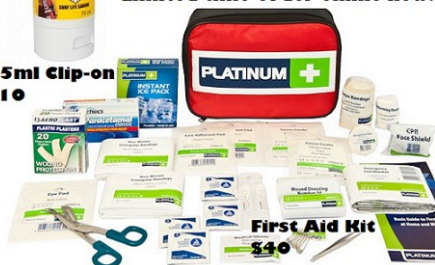
First Aid Kit $40

Pick up or Delivery options Limited time Order online now!